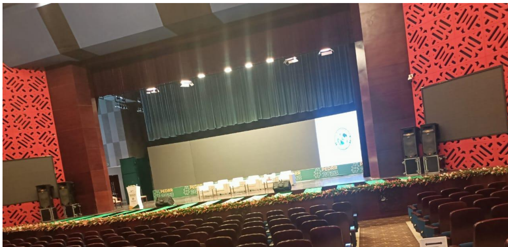
Figure 2 Pak China Center